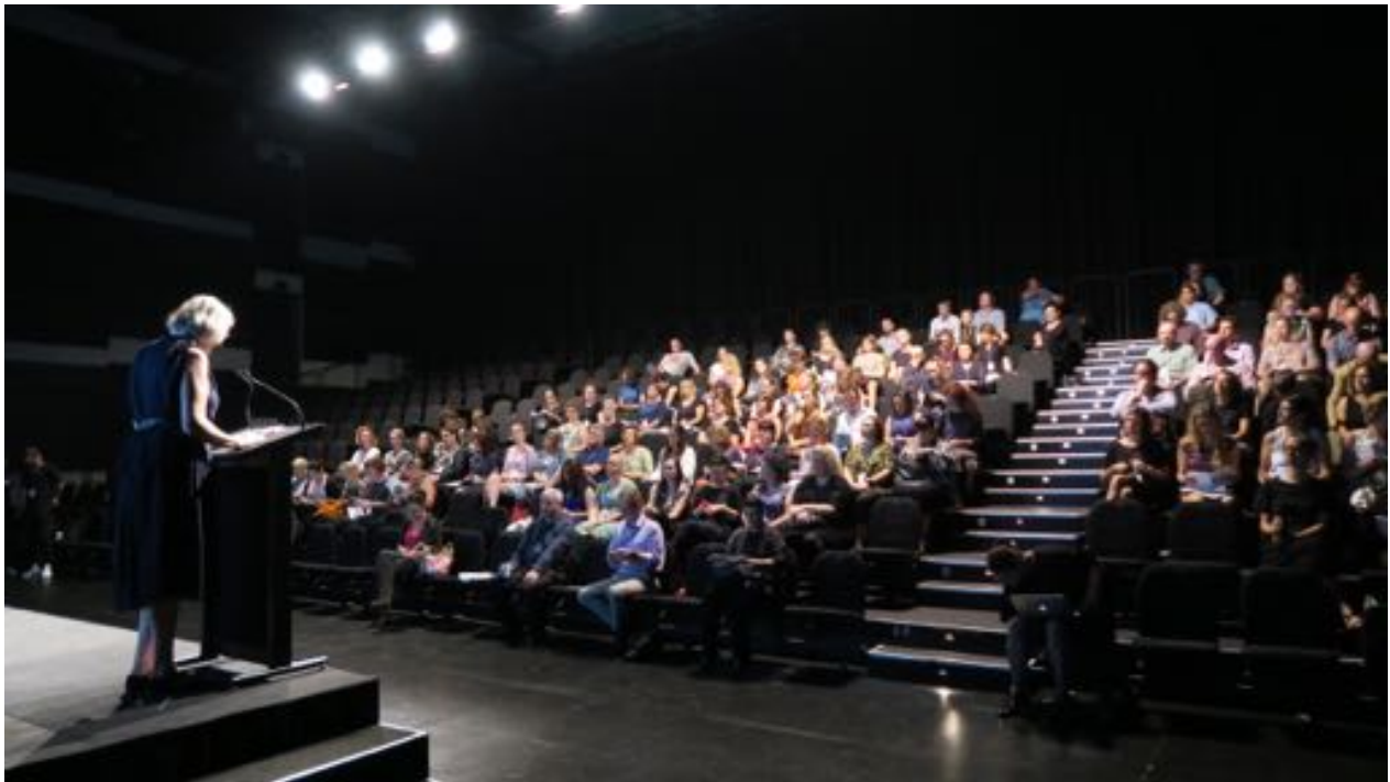
National Public Galleries Summit, Sydney.

"In March 2018, I was fortunate to receive an individual PGQ bursary to attend the National Public Galleries Summit 'Art & Artists' at Carriageworks and other cultural venues across Sydney. The summit coincided with the the 21st Biennale of Sydney, providing me with the opportunity to experience an international contemporary art event and to build my knowledge of current contemporary art practice."