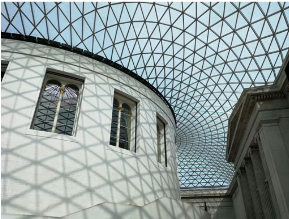
V&A Clothworkers' Centre, UK