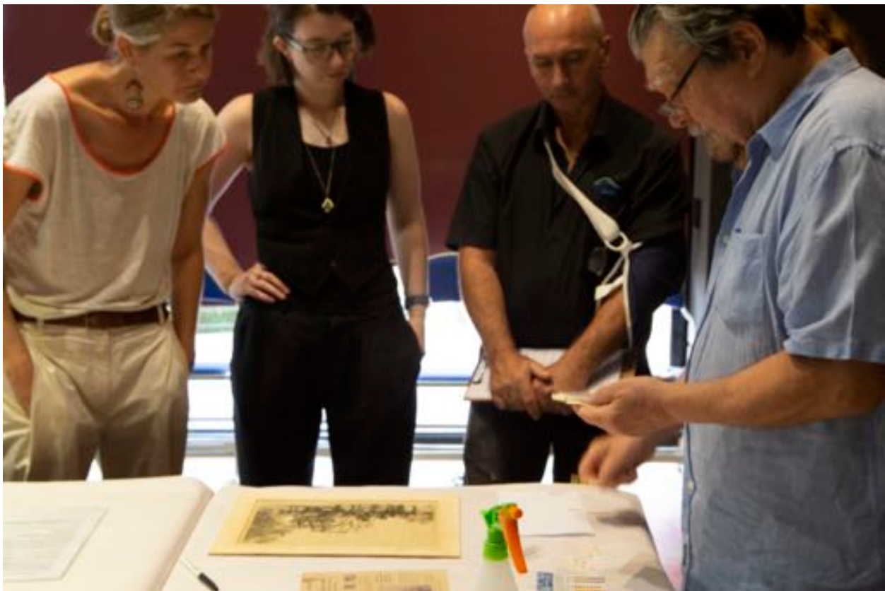
Rockhampton Conservation Workshop

"Conservation training was identified by management as necessary and valuable to the upskilling and professional development of arts and museum collection workers at our gallery. RSM Conservation developed and delivered the training in Rockhampton in March 2019. The workshop has brought Rockhampton Art Gallery staff, volunteers, and broader collecting institutions (including the Archer Park Railway Museum) onto the same page with high-expectations of care and handling requirements when in contact with collections. Thank you PGQ for generously supporting this initiative!"